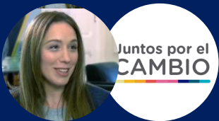
María Eugenia Vidal 35.93%