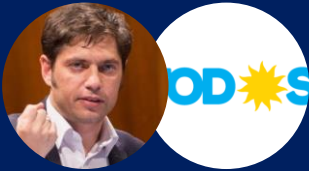
Axel Kicillof 52.13%

Despite the considerable growth of the governor María Eugenia Vidal, this was not enough to shorten the distance from the candidate of the Frente de Todos , Axel Kicillof, who reached 52% of the votes. María Eugenia Vidal showed her willingness to begin the transition process in the district. The result reflected the strong polarization observed at the national level. The victory of Axel Kicillof represents the recovery of the district by the Peronist Party.